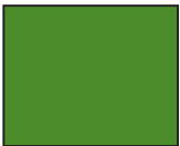
Pantone #363 Publix Green

The colors shown below should be cross-referenced with primary sign material colors: pre-finished returns, translucent vinyls and pigmented acrylic, for example. The Hunter Green and Navy Blue are not approved for translucent use. Letter faces in these colors will be white at night.